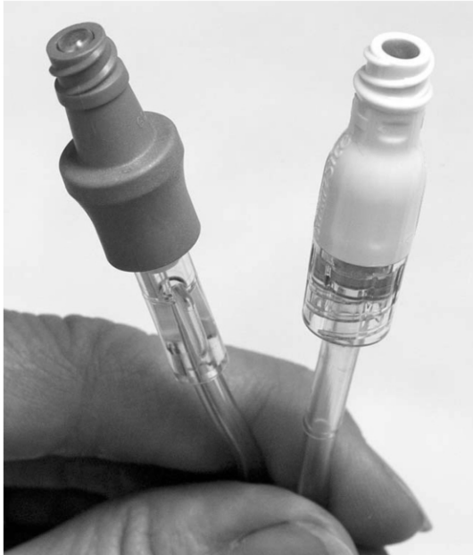
FIGURE 1. Two intravenous access ports used at the Johns Hopkins Hospital. The mechanical valve device used for more than 10 years is shown on the left, and the new, positive-pressure mechanical-valve device is shown on the right.

used. Use of the PPMV was subsequently discontinued in the rest of the institution.